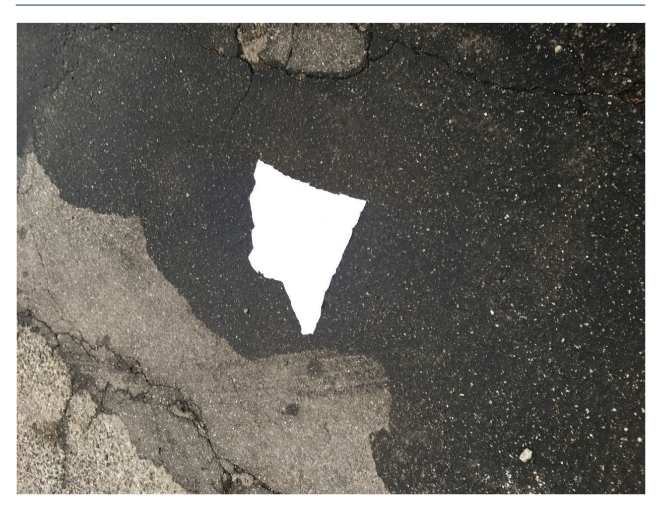
Figure 8 . This photo was taken before the rag was stepped on to show that there was no longer any leaked liquid present.

3780 Kilroy Airport Way, Suite 400 Long Beach, CA 90806 T: (562) 637-4400 | F: (562) 424-0166 conservation.ca.gov