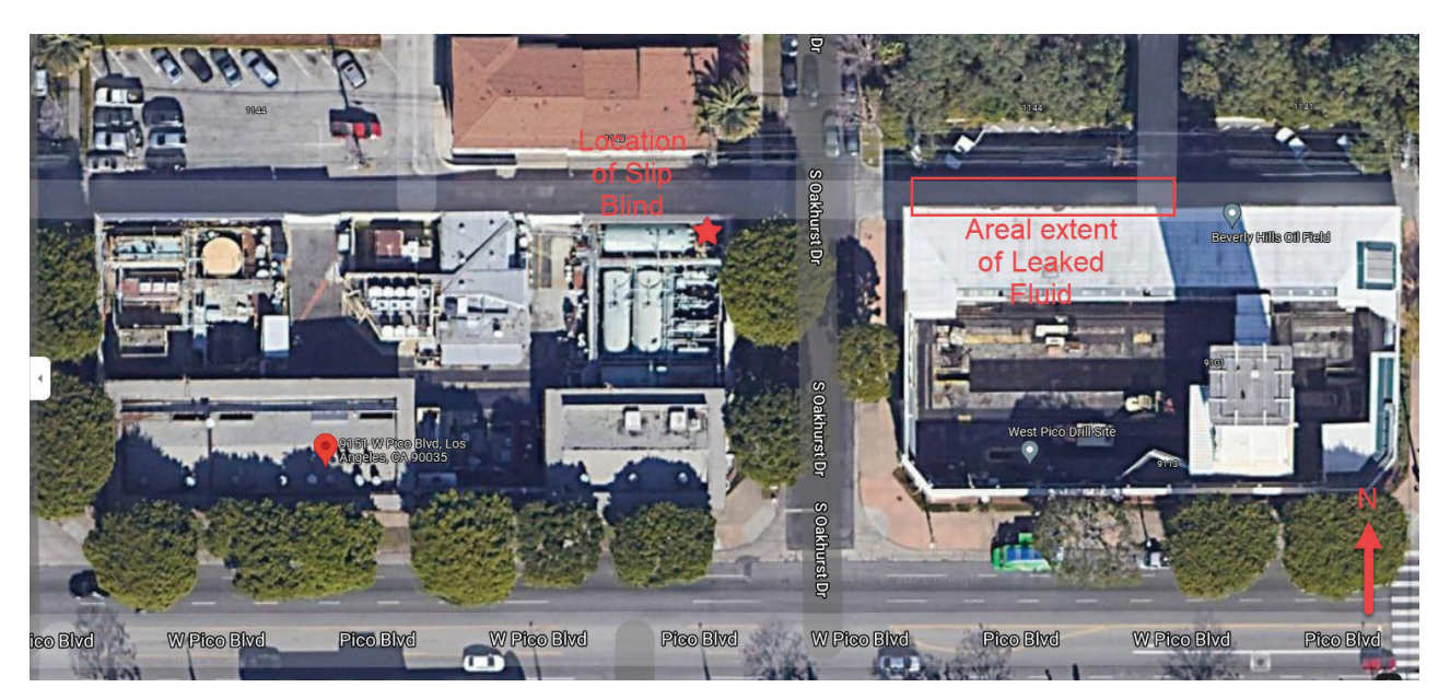
Figure 1 . Map of Drill site and facility compounds. Drill site is the right most building centered in map, facility compound is leftmost building centered in map.

3780 Kilroy Airport Way, Suite 400 Long Beach, CA 90806 T: (562) 637-4400 | F: (562) 424-0166 conservation.ca.gov