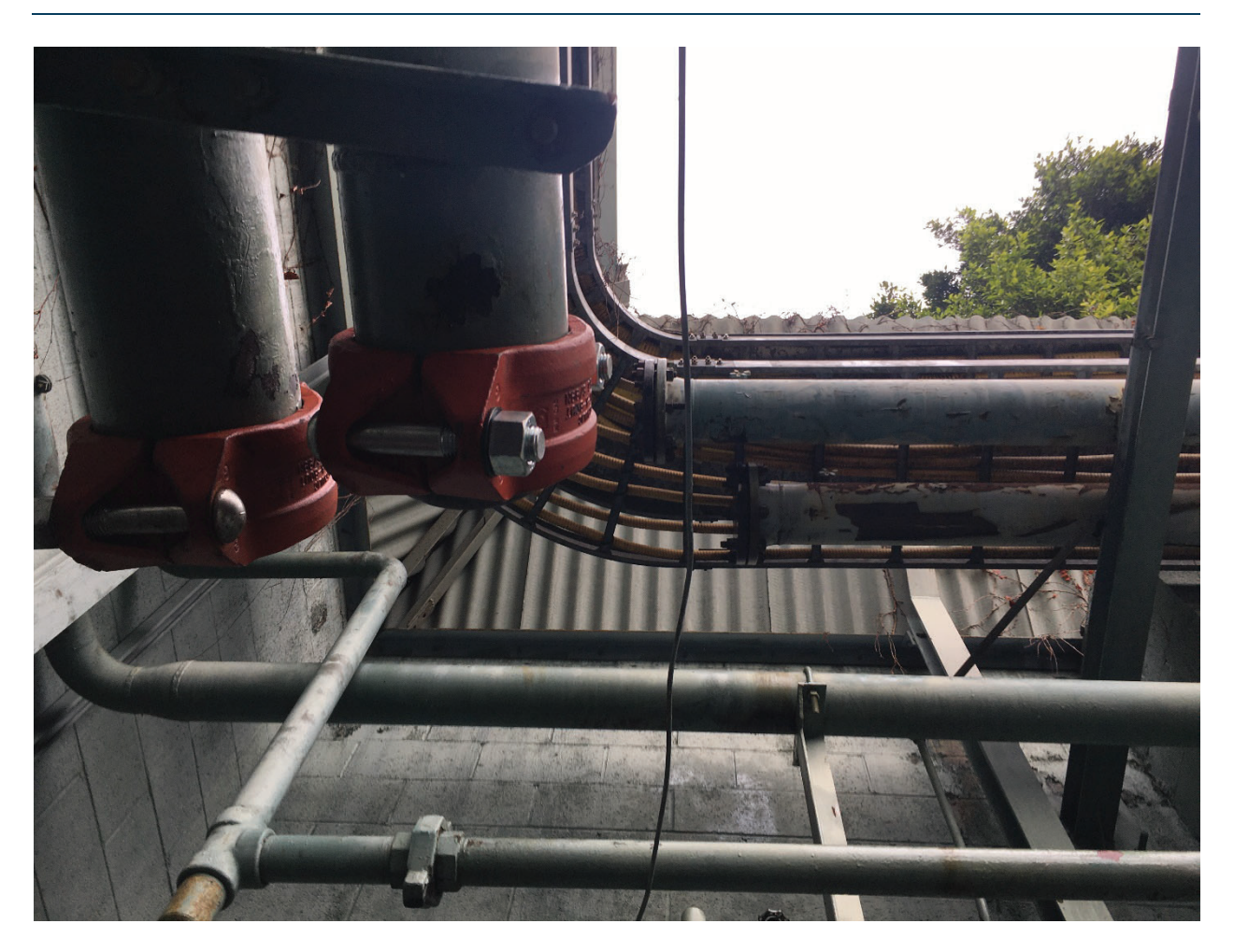
Figure 11 . The photo shows the out of service pipelines with red caps having been disconnected from the horizontal pipelines that are still under pressure. At the time of the leak, these two ends were connected and the out of service segment was isolated from pressure with the use of a "blind slip" that was found to be corroded to the point of leaking.

3780 Kilroy Airport Way, Suite 400 Long Beach, CA 90806 T: (562) 637-4400 | F: (562) 424-0166 conservation.ca.gov