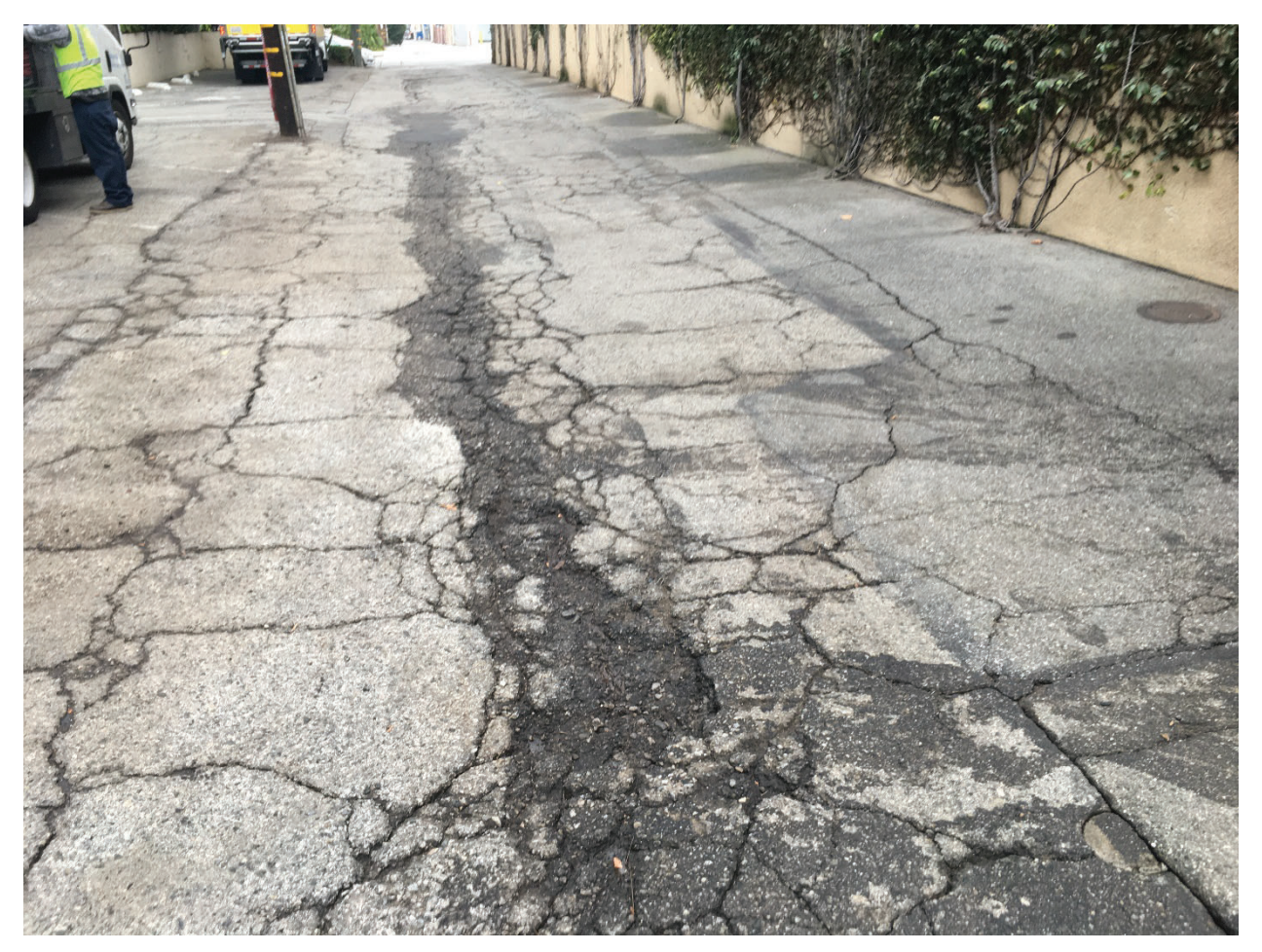
Figure 2 . This photo shows the area affected by the leaked fluid. The fluid pooled in the center of the alley and travelled west down the alley. It was reported that the fluid was removed with absorbent material and the ground was steam cleaned. At the time of the photo, there was no oil present. What is seen here is staining. There are no sewer or drainage systems affected. Visual staining was present on the alley surface.

3780 Kilroy Airport Way, Suite 400 Long Beach, CA 90806 T: (562) 637-4400 | F: (562) 424-0166 conservation.ca.gov