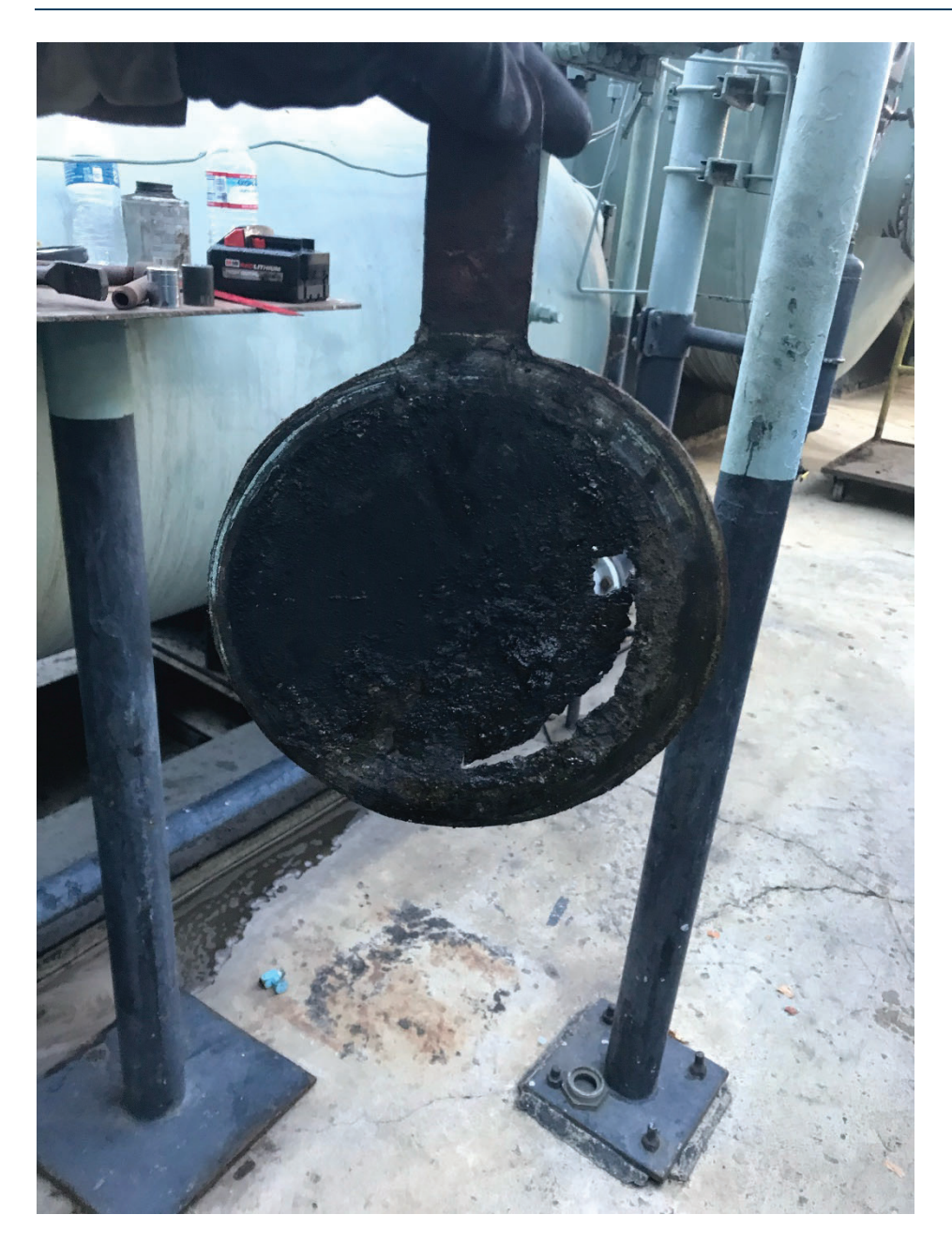
Figure 12 . This picture shows the corroded blind slip that was the root cause of fluid entering the out of service pipeline that is buried near surface expression of the leak in the alley.

3780 Kilroy Airport Way, Suite 400 Long Beach, CA 90806 T: (562) 637-4400 | F: (562) 424-0166 conservation.ca.gov