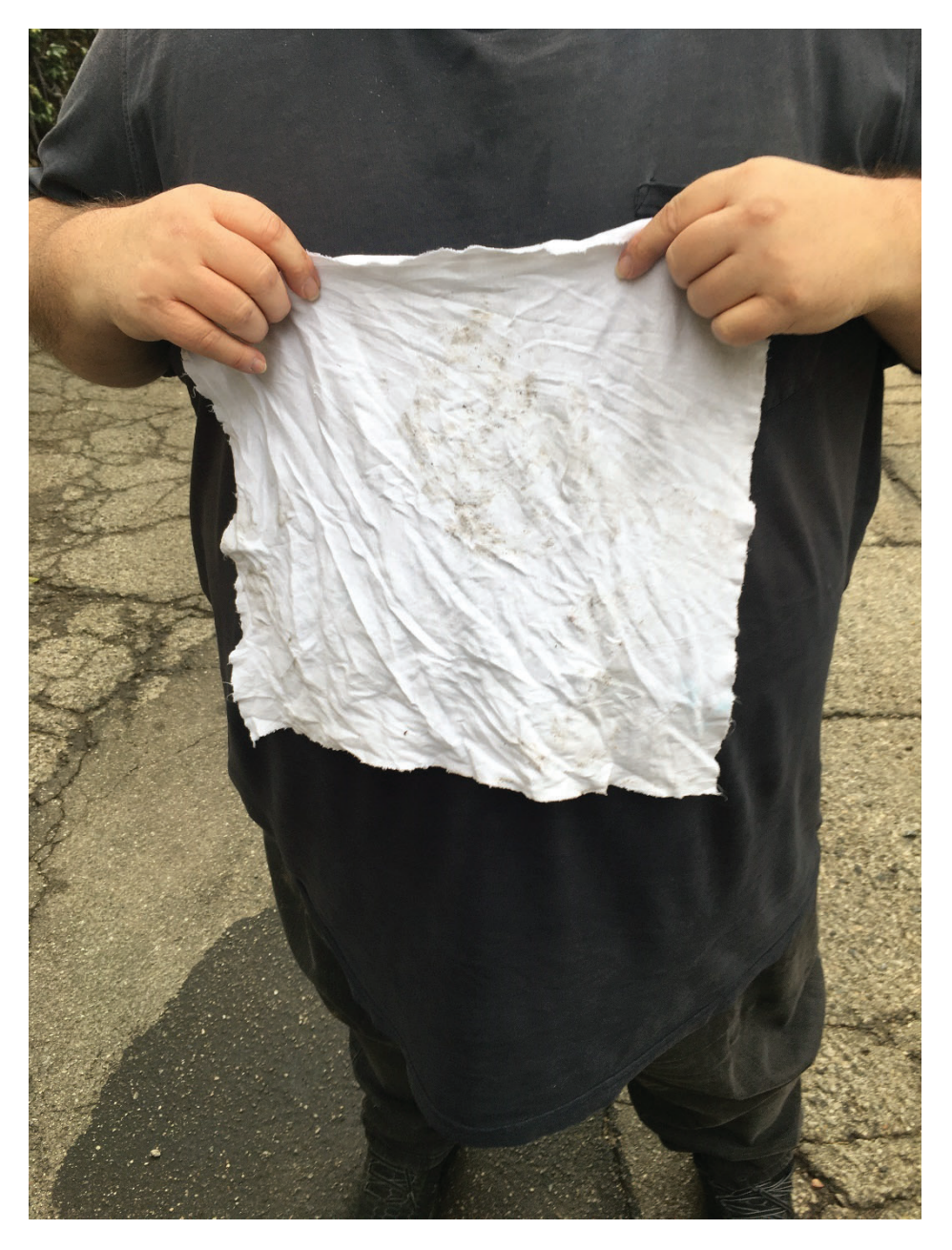
Figure 9. The rag was examined by J. Athanasious and did not show any evidence of liquid absorption.

3780 Kilroy Airport Way, Suite 400 Long Beach, CA 90806 T: (562) 637-4400 | F: (562) 424-0166 conservation.ca.gov