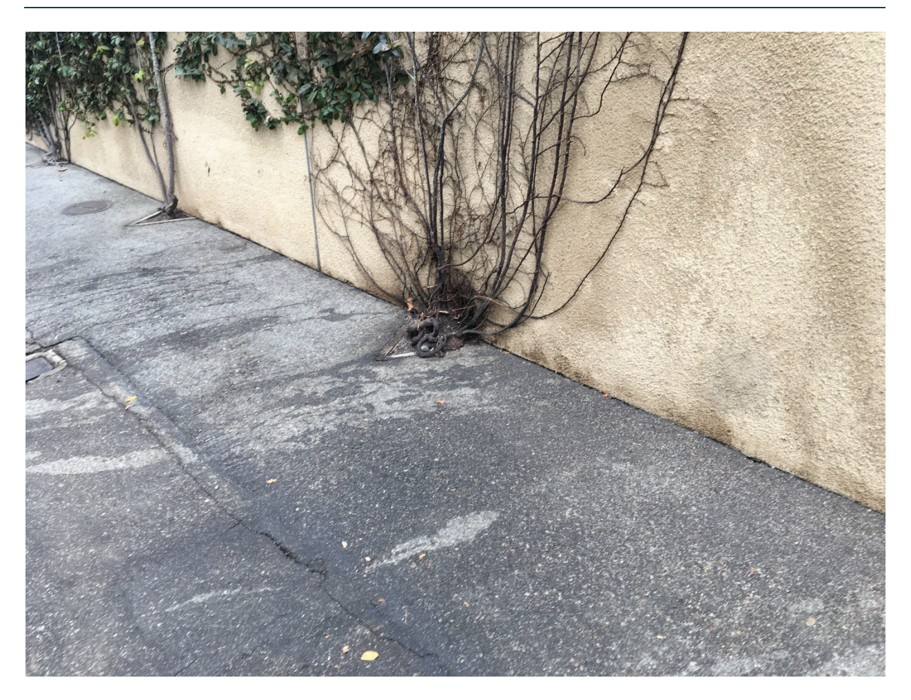
Figure 6 . The fluid was extruded through the joint where the building wall met with the asphalt alley. The area shown here was the main location of leaking with minor leaks further east and west in the photo. The area which had leaks was approximately 10 feet in length.

3780 Kilroy Airport Way, Suite 400 Long Beach, CA 90806 T: (562) 637-4400 | F: (562) 424-0166 conservation.ca.gov