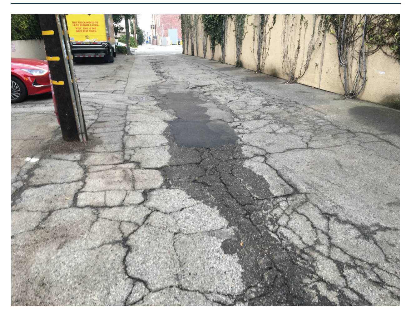
Figure 4. Shows areal extent of leaked fluid migration

3780 Kilroy Airport Way, Suite 400 Long Beach, CA 90806 T: (562) 637-4400 | F: (562) 424-0166 conservation.ca.gov