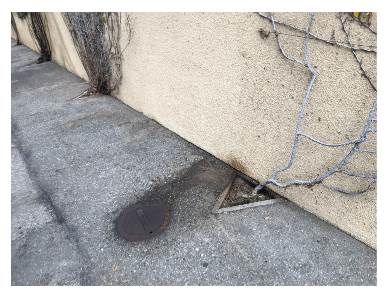
Figure 7. The leaks were in between these four vines pictured.

3780 Kilroy Airport Way, Suite 400 Long Beach, CA 90806 T: (562) 637-4400 | F: (562) 424-0166 conservation.ca.gov