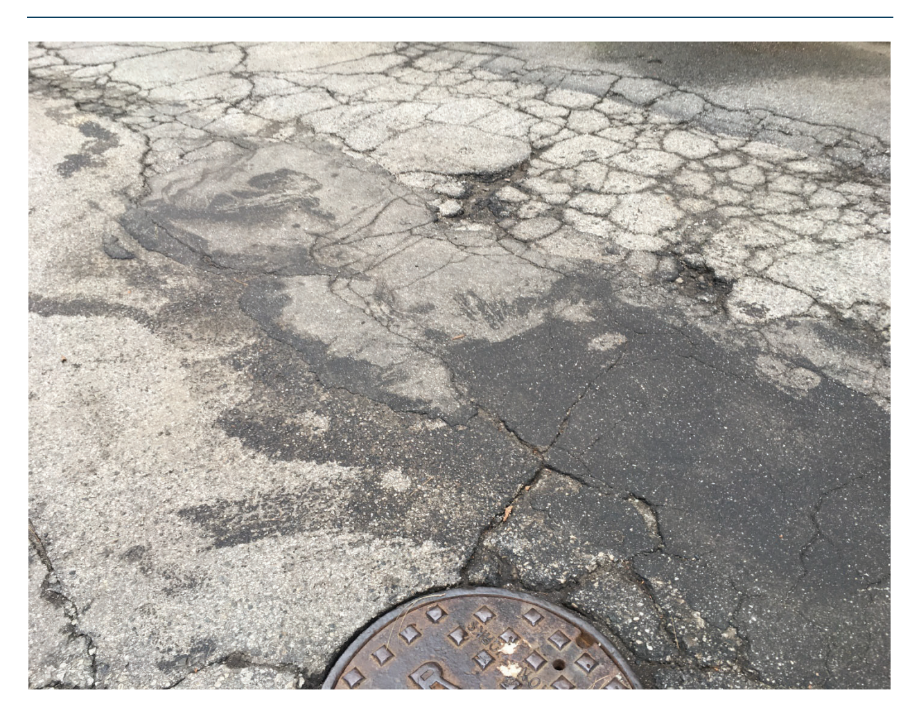
Figure 5. shows leaked fluid migration extent

3780 Kilroy Airport Way, Suite 400 Long Beach, CA 90806 T: (562) 637-4400 | F: (562) 424-0166 conservation.ca.gov