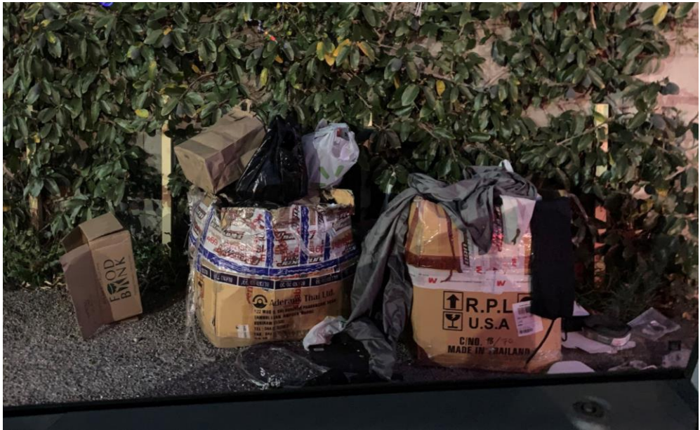
Exhibit A-4: More trash left behind on Hargis Street

Exhibit A-3: Same boxes in Exhibit C-9 that are being shown with illegal flea market vendors