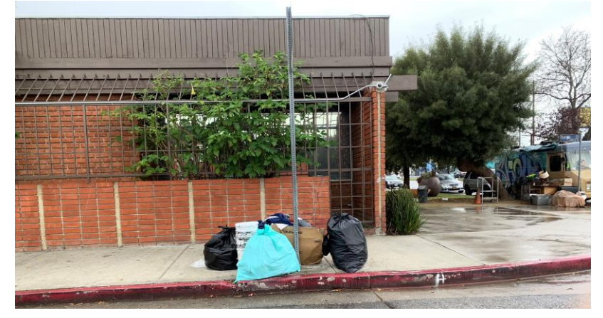
Exhibit A-6: Illegal dumping on residential Hargis street after vending ended

Exhibit A-5: Trash left beside 8600 Venice Blvd after the weekend, see the stalled ice cream truck in the background with trash spilling onto the sidewalk.