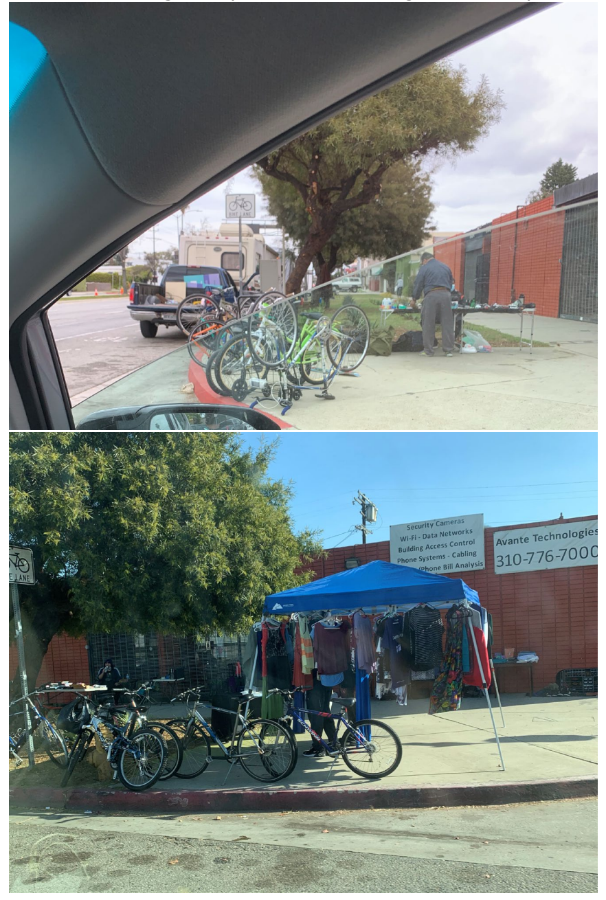
Exhibit C-1 and C-2: Multiple new bicycles for sale. Not adhering to the 3.5 feet rule from the curb, blocking fire hydrant, and vending within 500 yards of daycare.