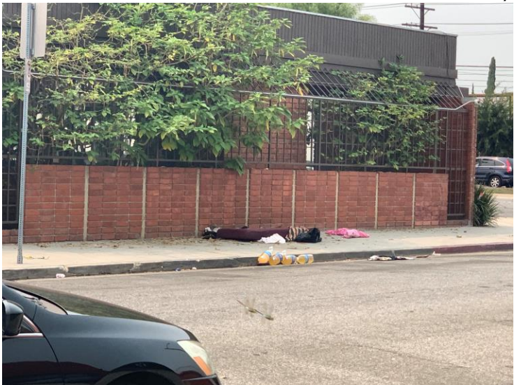
Exhibit A-8: More debris left behind on residential street.

Exhibit A-7: Debris left behind. The bottles most likely contained urine.