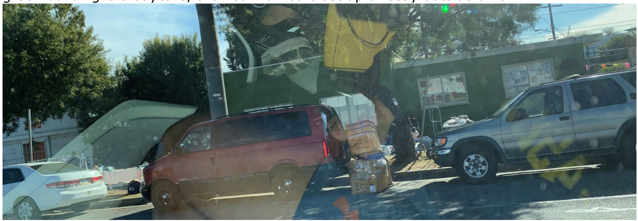
Exhibit C-10: Flea market vendors parked in red zone, blocking fire hydrant, vending on non sidewalk (damaged plants and sprinklers), less than 3.5 feet from the curb and vending within 500 yards of daycare.

Exhibit C-9: Same boxes illegally dumped in residential street alleys in Exhibit A-3. The green building is a daycare, the flea market is set up directly outside of it.