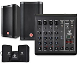
Harbinger M200-BT Portable PA System With Bluetooth and Custom...