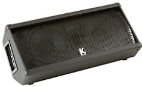
Kustom PA KPX210A 100W Dual 10" Powered Monitor