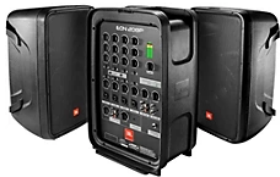
JBL EON208P 300W Packaged PA System