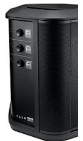
Bose S1 Pro+ Wire System