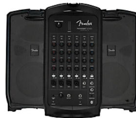
Fender Passport Event Series 2 375W Powered PA System