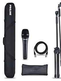
Proline Mic Pack