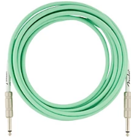
Fender Original Series Straight to Straight Instrument Cable 18.6 ft....