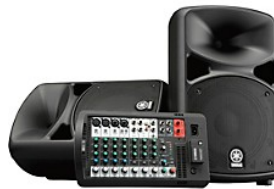
Yamaha STAGEPAS 600BT Portable PA System With Bluetooth